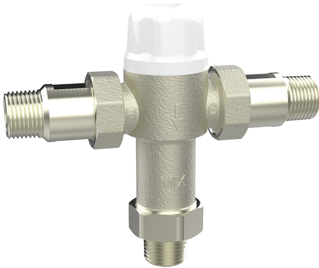
CAPACITIES – MODEL 570-1/2”